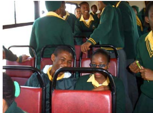
Bus trip to Sasolburg

The learners arrived on the day of the trip neatly dressed in green and gold. They were looking forward to learning something new and were excited about meeting new people. There were many questions of who had arranged the trip – the alumni society still being very new to them!