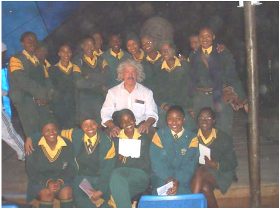
The learners with Albert Einstein

The learners had the opportunity to 'meet' the great scientist Albert Einstein. Einstein gave the learners an account of his life, his feelings, his family and work.