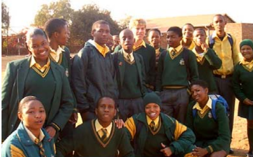
Some of the learners who attended the exhibition

The Sasol Techno X Exhibition is an annual maths, science and technology exhibition. The festival offers displays, workshops, tours, talks and hands-on activities. The interactive fair is aimed at learners, students and the general public.