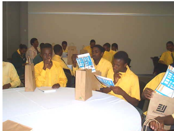
Learning about the accounting profession

The exhibition introduced the learners to accounting and also taught them about careers in auditing, corporate finance, financial management and tax advisory. The learners were informed about where to study, what courses to enrol for and what they needed to do to succeed.