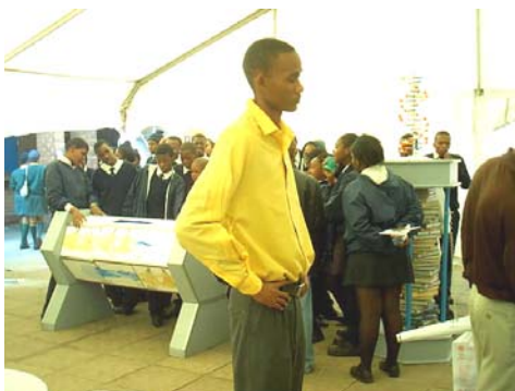
At the forensics exhibition